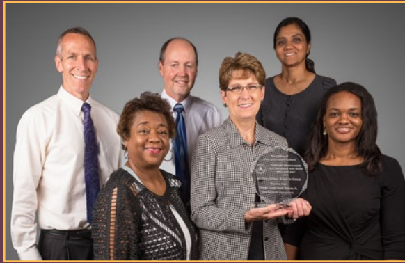
Award winning team with the Knighton Award

Your supervisor Hotline – 407-317-3976 OCPS Internal Audit Department – 407-317-3200, ext. 2002897 OCPS Legal Department – 407-317-3411 OCPS Police Department – 407-317-3325